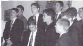
The Senior Class of 2005-2006 sing a tune by Burns in tribute to the great poet and song writer of Scotland. Other poems and songs by Burns were recited and sung by the students after the meal and into the evening.