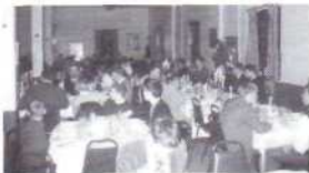
The students, faculty, staff, and guests gathered in the candlelit Refectory for the Robbie Burns Supper. A meal consisting of traditional Scottish fare was served in honor of the poet.